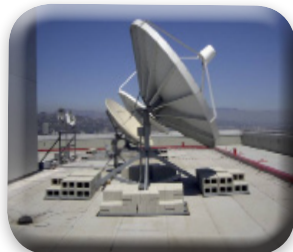
Receive Only Antennas