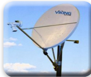
Motorized VSAT Inclined Orbit Tracking Antennas