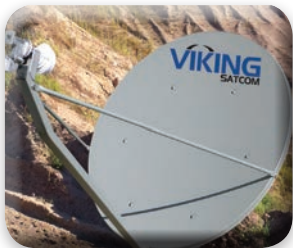
Transmit Receive VSAT Antennas