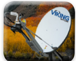
Mobile, Auto-Point Antennas