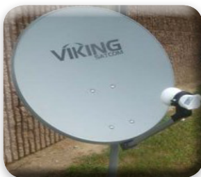
Direct To Home Antennas